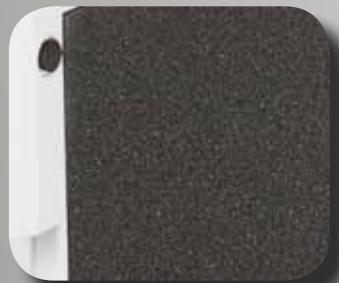
Noise absorbing material