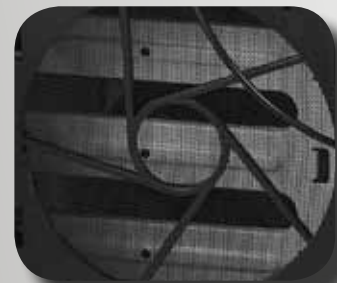
Removable fan filters