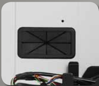
Cover for tidy cable routing

"Define R3 case is reaching new heights in combining stylish, contemporary design with maximum functionality and noise absorbing features"