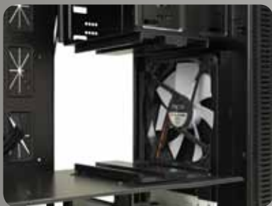
180mm fan in optimized angle