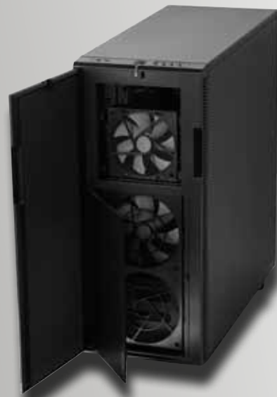
Maximum airflow in the frontpanel

Titanium Grey FD-CA-DEF-XL-USB3-TI EAN:7350041080688 UPC:817301010689